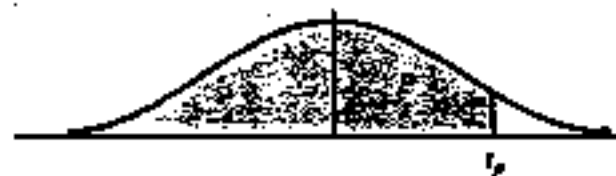
Table 4 Percentiles of the t distribution