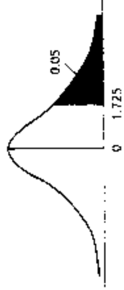
TABLE D.2 Percentage points of the t distribution